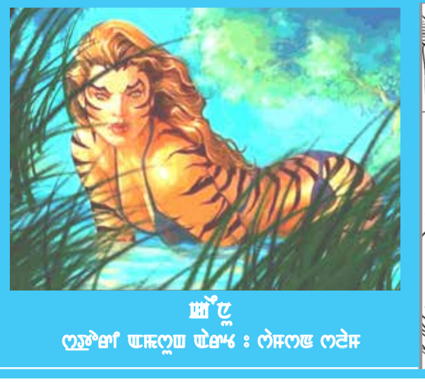
8-5-2020 MINISTRY OF YOUTH AFFAIRS & SPORTS