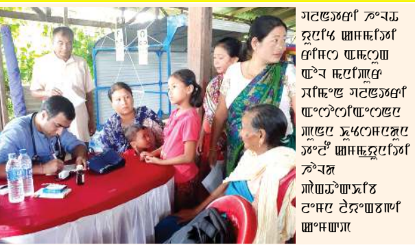
Meeting or discussion details...