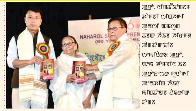
Award ceremony details...