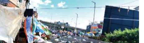
Person working with waste details...