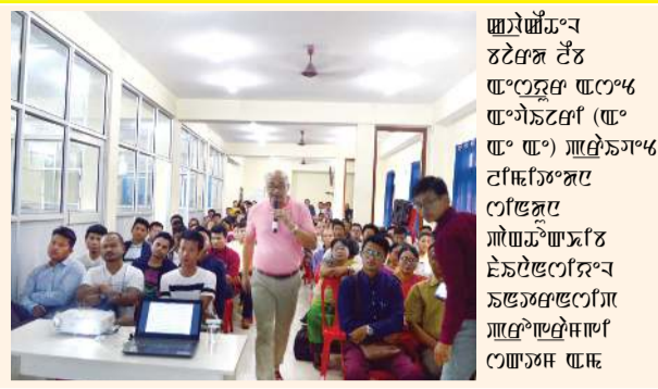
Classroom or training session details...