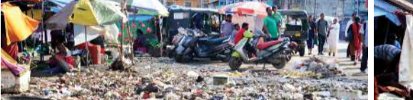
Person working with waste details...