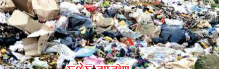
Garbage pile details...