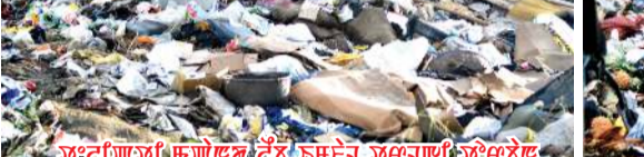
Garbage pile details...