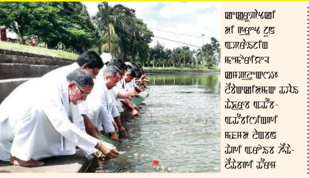
Water conservation program details...