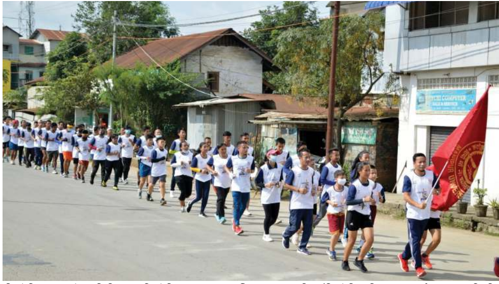
ফিট ইন্দিয়া কেম্পেইন কামিটি অমসুং ফিট ইন্দিয়া ক্লাব, এম য়ুনা শীন্দুনা পাঙথোকখিবা 'ফিট ইন্দিয়া ফ্ৰিম ২.০' দা শৰুক য়াখিবশি