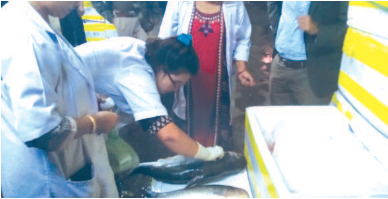
নিংঙোল চাক্কো মাঙওইননা হেষ্ঠ দিপাটমেন্টকী মখাদা লৈবা ফুদ সেফটি এডমিনিস্ট্ৰেশননা খাইইরফদ কৈথেলাদা য়োল্লিবা ঙাদা ফোমেলিন য়াওত্রা য়েংবা

ট্রাণ্ডেচ/শাগন অনীমক হায়দোক হায়জিন তৌবদা নাবা, পুজো গোট্টিক কাৰুগা চাবা থকপা য়াদবা, য়ারোমদা য়ান্না তৌয়না তৌয়না খেগৎলকপা, য়েংকী হকচাং তঙুখায় অমা শিথবঙম তৌবা, অতেক অনৌ চাবা য়াদবা, খোঙ হান্না য়াদবা ফহনবগী ওজা জিয়া উল হগপু থাগৎচরি