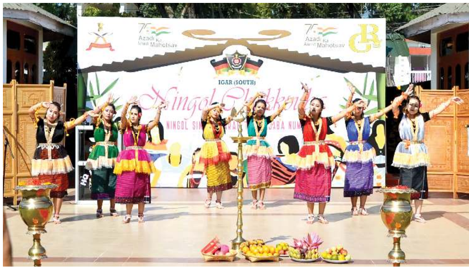
আই জি এ আর সাউথনা শিন্দুনা মঞ্জিলাদি পাঙথোকখিবা মনিপুরী নিঙোলশিংবু চাক্লেবগী খৌরমগা মরী লৈননা পাঙথোকখিবা নাংকী ওইবা কুই

Sd/- Sub-Deputy Collector, Heingang, Imphal East