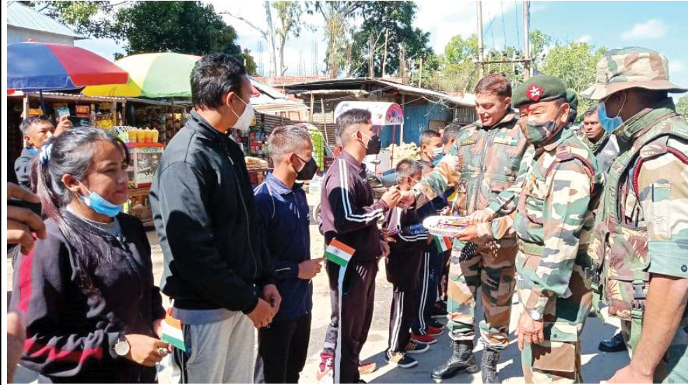
ইন্দিয়ানা নিং তজা চহী ৭৫ মপুঙ ফাখিবাগা মরি লেননা অসাম রাইফলসনা শিন্দুনা চংখিবা মোদিরসাইকল রোল্লিমা মণিপুর যৌরকখিবা তরাম্মা ওকখিবা