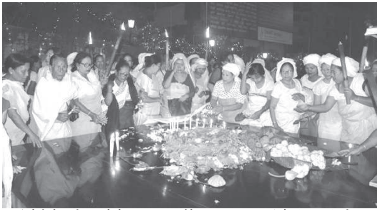
অধিবংশিগী নুইংকা মরী লেননা সহিদ মিনর মখোঙা মৈরা পায়বিশিংনা হৈকৎ-লৈকৎ তমদুনা অধিবংশিগী হৈকাই খুন্না উৎপণী শক্তম

ট্রাফিক/খোঙ হায়ার জব্বা, খোঙ হায়দা মতম কুইনা চংবা, অমাঙথোং মরং মরং চংলকপা, পুজা গ্যেটিক কারগা চানিং থক্লিংবা পোক্লুজব, খোঙ হায়া খুদিংগী দ্রোপ দ্রোপ তারকপা, অমাঙথোং ময়াদা মচা ওইনা পোমথোক্লুগা লেবা ফহনবগী ওজা জিয়া উল হগপু থাগৎচরি