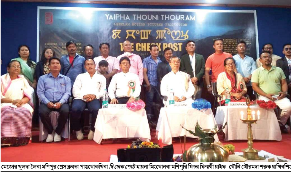
মোজোর খুলাদা লেবা মপিপূর প্রেস ক্লাবতা পাঙখোকখিবা 'দি চেক পোস্ট' হায়না নিংখোনবা মপিপূর ফিচর ফিল্মগী হাইফ-থৌনি থৌরমদা শরুক য়াখিবশি