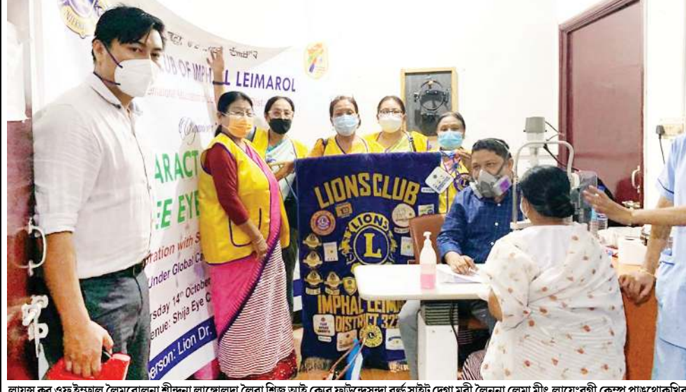
লায়ন্স ক্লাব ওফ ইমফাল লেইকোলায়ন শীড়না লাসোলদা লেইবা শিজ আই কোর ফাউন্ডেশনদা বর্ক সাইট দেগা মরী লেননা লোম্বা মীং লায়ংবকী কেপ্প পাঙ্কথোকখিবা