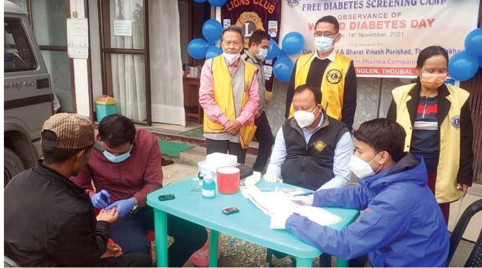
লাইংস ক্লব ওফ খৌবালা ভারত ডিকাস পরিষদ অমদি ফার্মা কম্পানিশিংগা খুংশান্দুনা হার্ড দাইবিস দেগী যৌরম খৌবালা ফেল্ডি শঙলেদা পাঙথোকখিবা