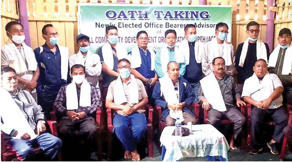
ওল কম্মিউটি দিবলপমেন্ট ওর্গানাইজেশন মোরোগী নৌনা যৌ পুনবীরদমক খল্লাবা মী ওইশিং রাশক লৌবগী যৌরম ওর্গানাইজেশন অসিগী কমফরেন্স হোলদা পাঙথোকখিবা