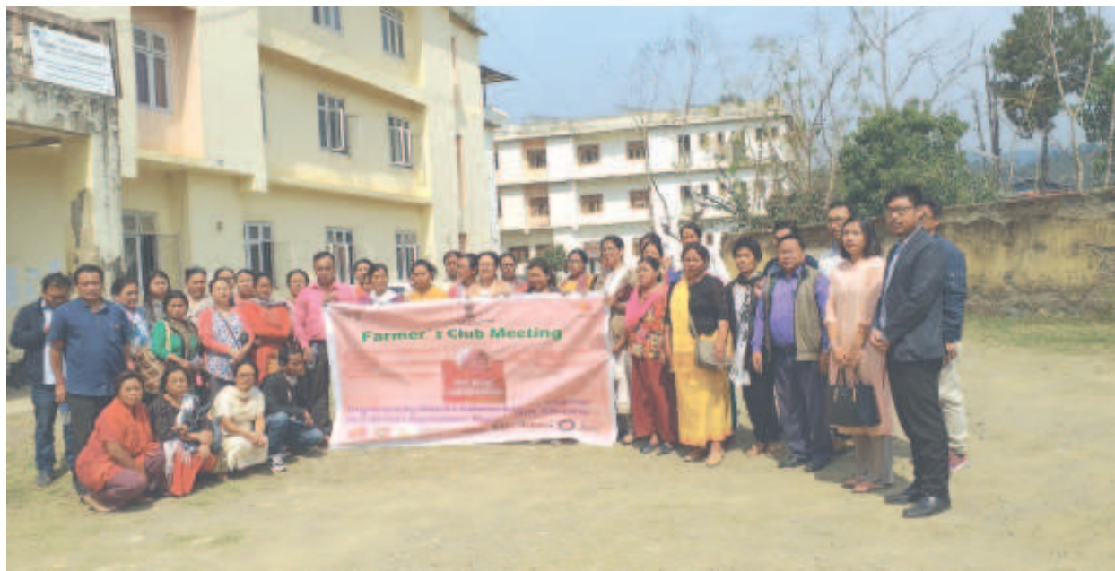
দিষ্টিক্তি এগ্রীকালচার ওফিস চান্দেল, দিষ্টিক্তি এডমিনিস্ট্ৰেচন আই সী দি এসকা খুংশম্নদুনা পোসান পথৰাদাগী মখাদা পাঙথোকপা ড্ৰামট্ৰিক প্ৰাট্টেসনগী থৌমৰ