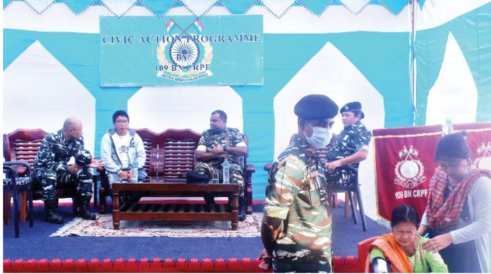
১০৯ বর্টলিয়ন গী আর পি এফনা শিন্দুনা লংখাবাল চীংখাদা পাঙথোকখিবা সিডিক এল্লন প্রোগ্রামগা মরী লৈনবা সি হেল্ট কেন্স পাঙথোকখিবা