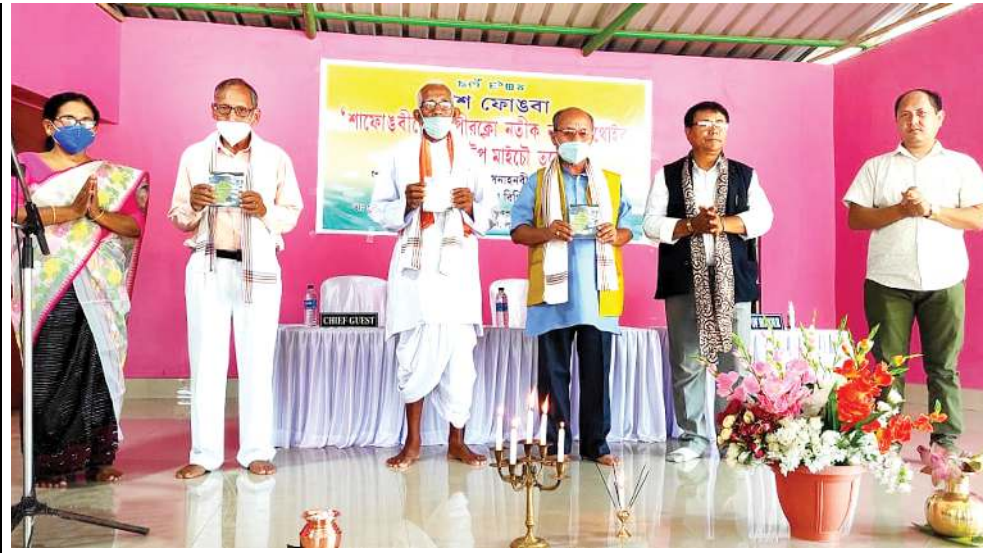
কংলৈ পুরারীদা অটৌবা মফম কল্লিবা মাইটৌ শ্রেংকী মতিক ময়াই শৈখোবা দ্রেশ অমা লুরাংশংবম মথা লোকায়দা লৈবা পল্লেইবী শঙলেনদা ফোঙখিবা