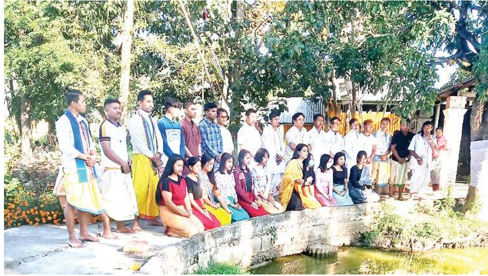
ইম্ফাল ইষ্টকী উচ্চশিক্ষা মঞ্চ লোকায়দা লেবা ইনুই পান্ডা পুরুক শৌবিদা ইনাং য়োকখং লূপকী থৌমিশিংনা থৌনিজবনী থৌরম পাঙথোকখিবা