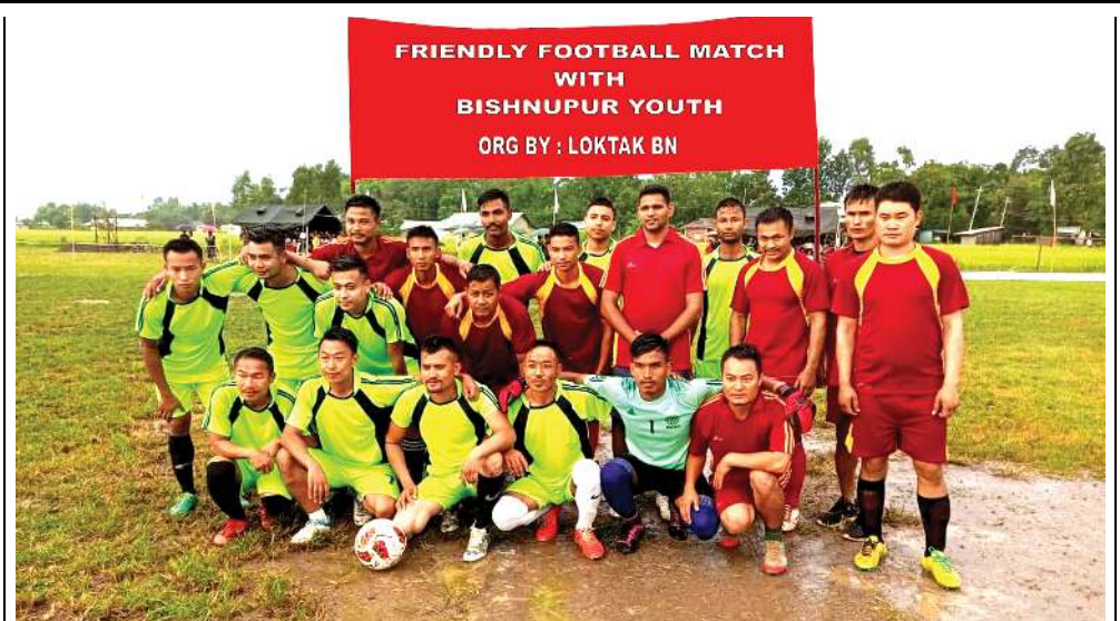
লোক্তাক বটালিয়ন অসাম রাইফলসনা শিন্দুনা বিষ্ণুপুর দিষ্টিক্টকী মনুং চনবা নাচৌ ভিলেজগী নহাশিংগা ফ্রেন্দলি ফুটবোল মেটচ অমা শান্নখিবা