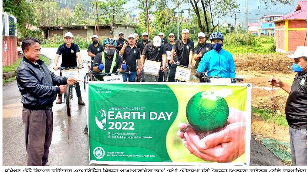
মণিপর ষ্টেট লিগেল সর্ভিসেস ওথোরিটিনা শিন্দনা পাঙ্থোকখিবা আর্থ দেগী থৌরমগা মরী লৈননা চৎকদবা সাইকল রেক্সি লমথাখিবা