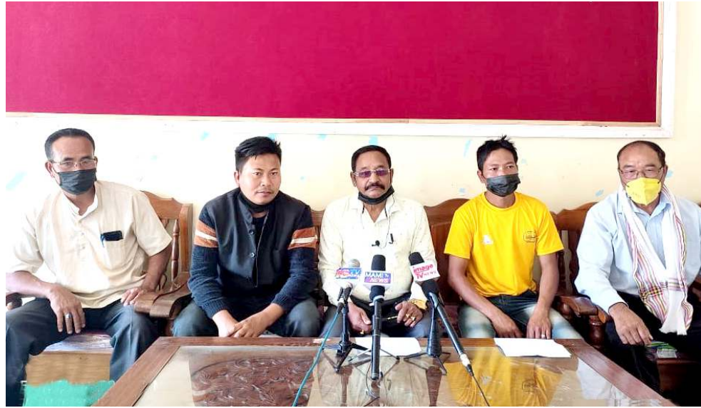
শ্বাই নুংশেং শিহ্না লুপ্তা শীন্দুনা মণিপুৰ প্ৰেস ক্লবতা পাঙথোকখিবা কৌলু লৈবা অমসুং কৌলু লৈথকপু মণিপুৰ লৈঙল্ল অকল্পৰা মতমা পীদুনা হেৰিটেজ সাইট ওইনা শেমগংহাৰাবনী দিমাংদ তৌৱদুনা পাঙথোকখিবা পাউলী মীফমদা শৰক য়াখিবিশং

দিমাপুৰ, এপ্রিল ২৪ (এজেন্সী): নাগা লালহোবা গ্ৰুপ এন এস সী এন (আই এম) গী জেনেৰেল সেফটেকটৰি থুইঙালেং মুইভা ন্যু দেল্লীদনী দিমাপুৰদা লৈবা কেম্প হেব্রোন্দা হল্পকে।