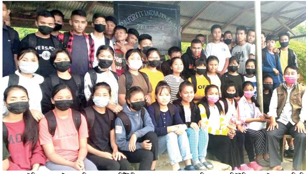
চুচুচাঁদপুৰ বাপ্টিষ্ট হাইস্কুলৰ শিক্ষার্থীসকলৰ সৈতে শিক্ষকসকলৰ সৈতে পৰিচালনা কৰা ছবি।

Junior Research Fellow Job Location: Agharkar Research Institute, G. G. Agarkar Road, Pune 411004, M.S., India Gopal Ganesh Agarkar Road 411004, Pune, Maharashtra Employment Type: Full Time Number of Vacancy: 1 Posts