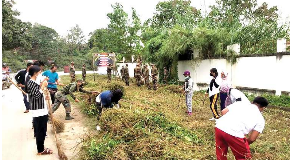
কেথেলমানবী বটালিয়ন অসাম রাইফলসনা শিন্দুনা খোবাল দিষ্ট্রিক্ট নাহক যুব কেন্দ্রীয়া ভোলন্টিয়ারিংগা পুয়া শিং শেংবগী থবক পাঙথোকখিবা