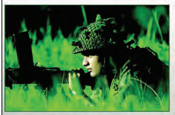
GUARDING THE INDO-MYANMAR BORDER