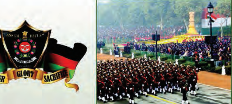
PRIDE OF THE NATION