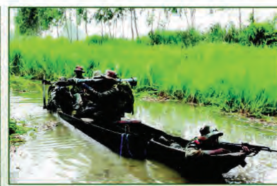
EUDENED IN UDED VIIUNG